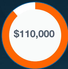
The average salary for management in the industry