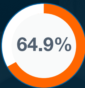
Managers with at least a Diploma qualification