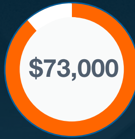
The average salary for management in the industry